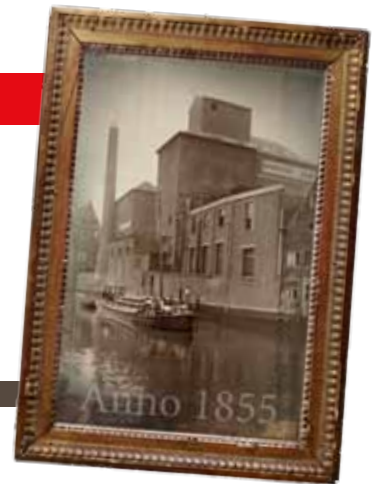
LAMOT BREWERY ANNO 1855

City Archive and the Mechelen National Heritage Cell. All these departments have worked intensively to build the heritage story in and around Lamot over the last few years. The added value of a combined conference centre and national heritage centre is that Lamot visitors can become acquainted with Mechelen's heritage in all kinds of ways. The wide selection includes: a unique ascent of the Saint Rumbold's tower, a walk along archaeological sites and lectures on the history of the City of Mechelen.